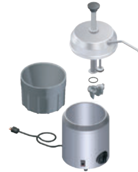
81184 FSP Conversion Kit